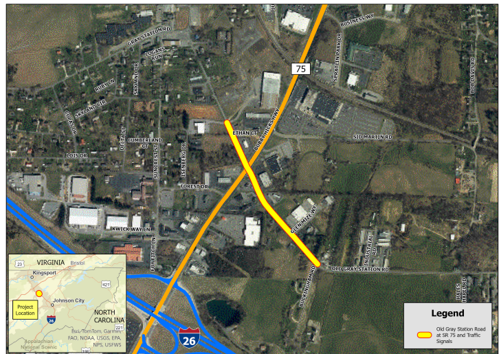
Old Gray Station Rd Section 2 at SR-75 and Traffic Signals

Amendment 3 (STIP 138) (8/7/2024) - Amended to add $700,000 in Congressional Earmark funds (DEMO ID TN295) and $175,000 in local match and move PE-N, PE-D and ROW to FY 2025, move CONST to FY 2026, and decrease the scope and termini.