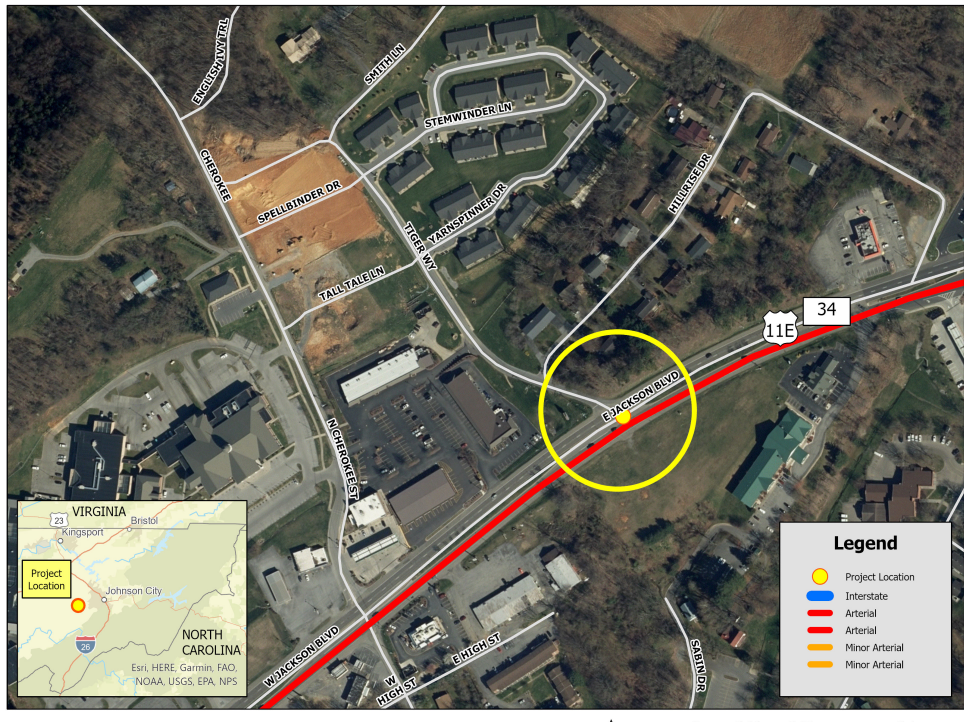
Traffic Signal for SR 34 (US 11E/ E Jackson Blvd) & Tiger Way