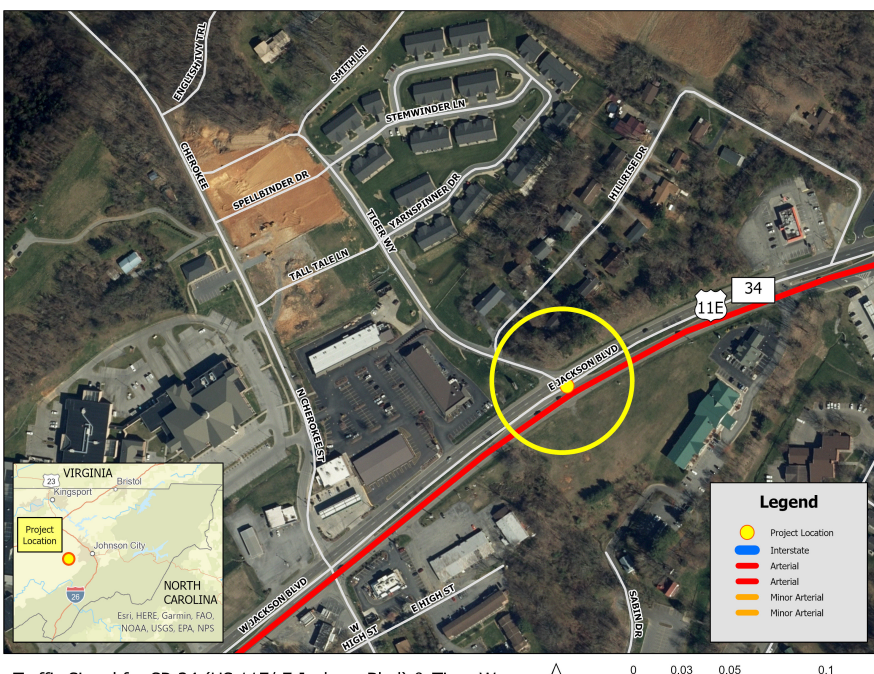
Traffic Signal for SR 34 (US 11E/ E Jackson Blvd) & Tiger Way